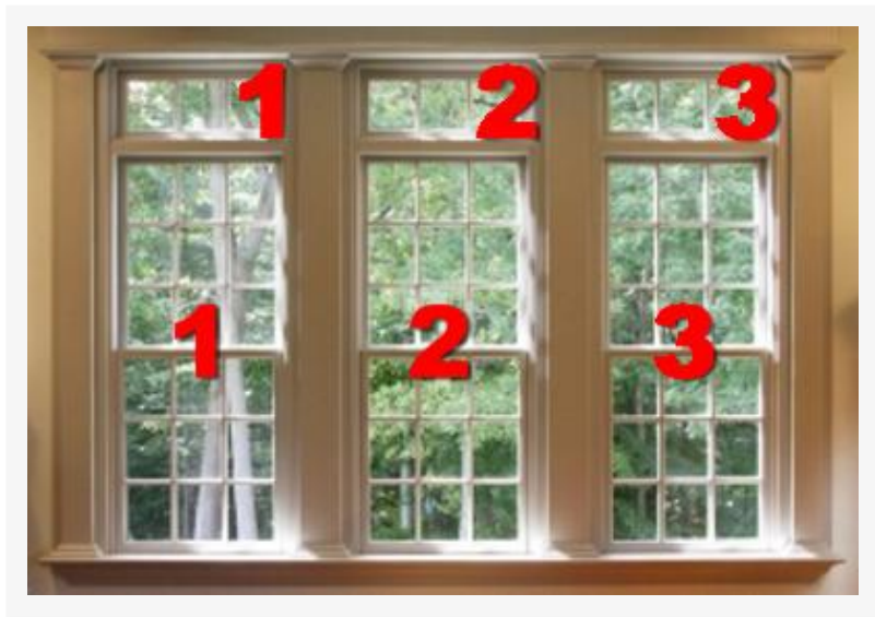
3 Transoms with Fixed Grids (3 Panes Each)