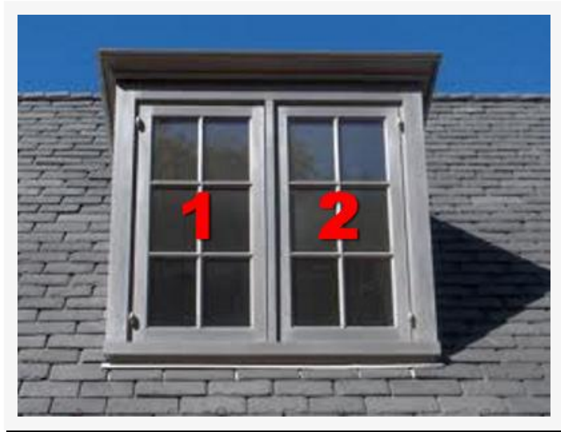
2 Non-Standard Casement Windows with Fixed Grids (6 Panes Each)