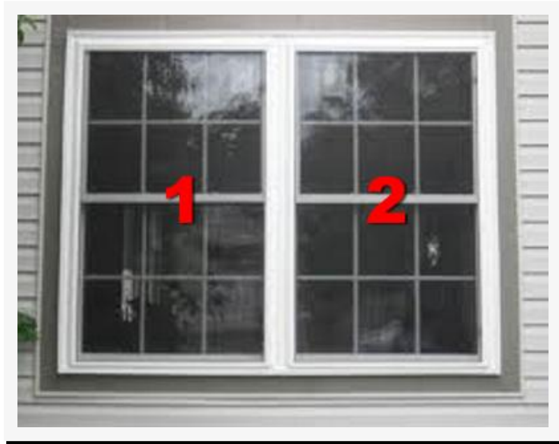
Standard Double Hung Windows with Grids Inside Glass Panes