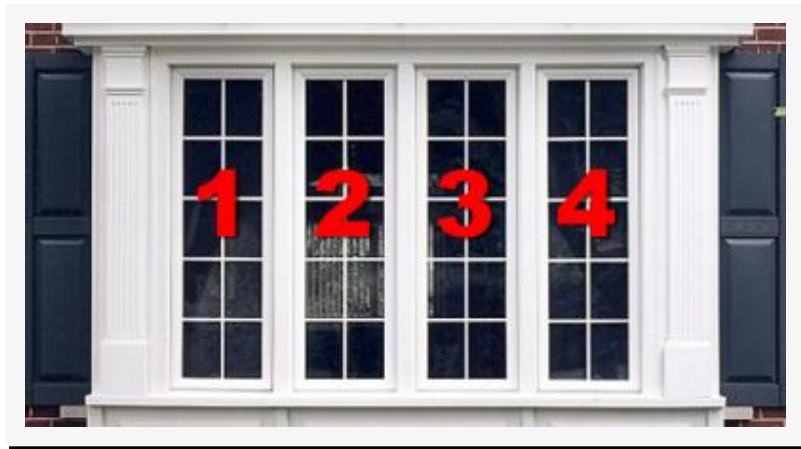
4 Casement Windows with Removable Grids